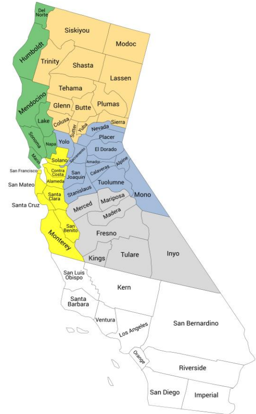
Northern California Metro List ■ Coastal Region North ■ Coastal Region South ■ Northern Region ■ Inland Region ■ Valley Region □ Southern California